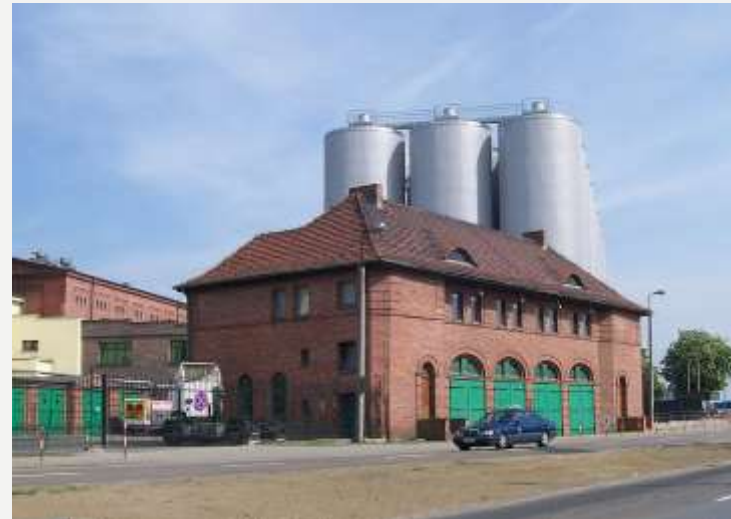
Brewery in Tychy