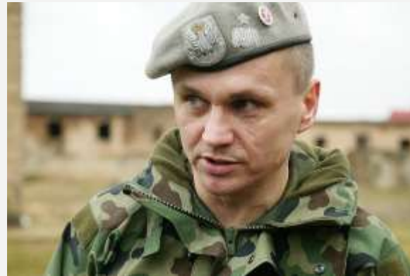
Roman Polko (Major General of the Polish Army)