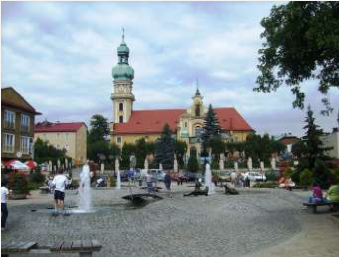
St. Mary Magdalene Church in old town