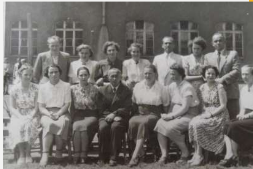
First group of teachers