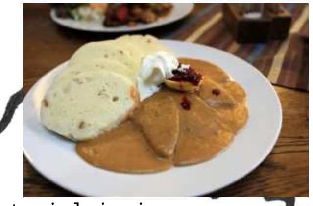
Roast pork with dumplings and Roast sirloin in sour cream sauce sauerkraut with dumplings