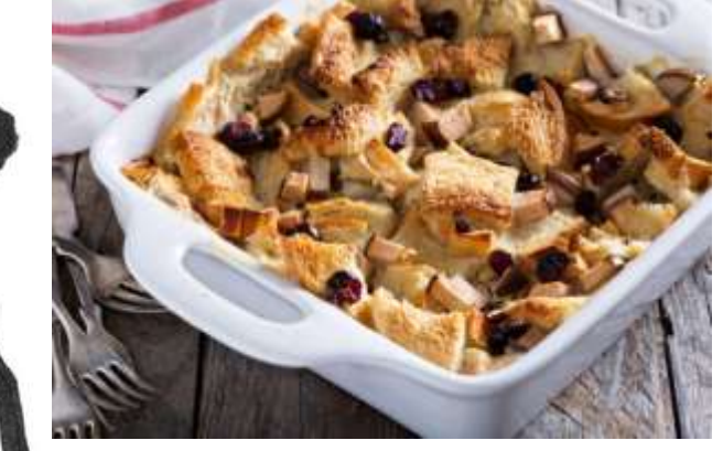
Bread and butter pudding